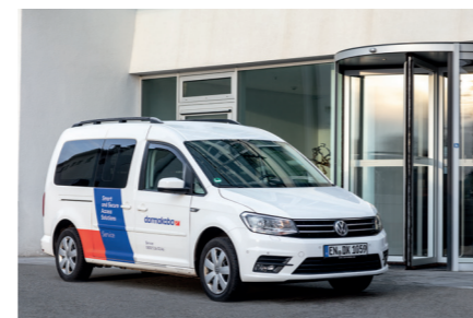
Independent support State-of-the-art-equipment.