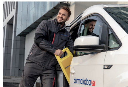
Always near Local presence.