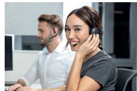
24/7 rapid assistance We provide quick, hassle-free support in case of malfunctions.

A building that is in active use requires a surprising amount of maintenance to keep things running smoothly. Regular maintenance and checks ensure that your doors are always up to date and that failures are effectively prevented. We help you take care of access in your building with our safe, simple service.