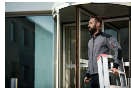
Dedicated Team of fully trained and equipped experts.