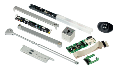
Quick spare parts supply Efficient supply chains always ensures high availability and quick delivery times.