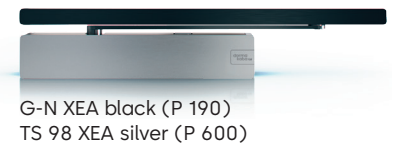
G-N XEA black (P 190) TS 98 XEA silver (P 600)