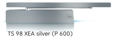
TS 98 XEA silver (P 600)

TS 98 XEA features an excellent design, which truly does open doors: the closer is not only suitable as a design element, but it can also be easily combined with other dormakaba products in the XEA design. Thanks to numerous colour and surface finish variants, you have a whole range of customisation options open to you and can be as flexible as you wish from an aesthetic point of view.