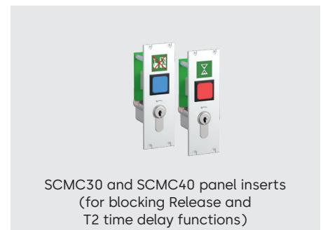
SCMC30 and SCMC40 panel inserts (for blocking Release and T2 time delay functions)