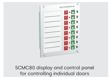
SCMC80 display and control panel for controlling individual doors