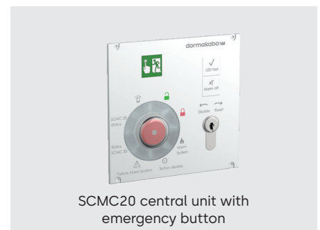
SCMC20 central unit with emergency button