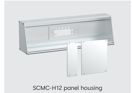
SCMC-H12 panel housing